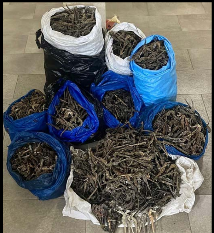
4 traffickers were arrested in Guinea with thousands of seahorses weighing 41 kg