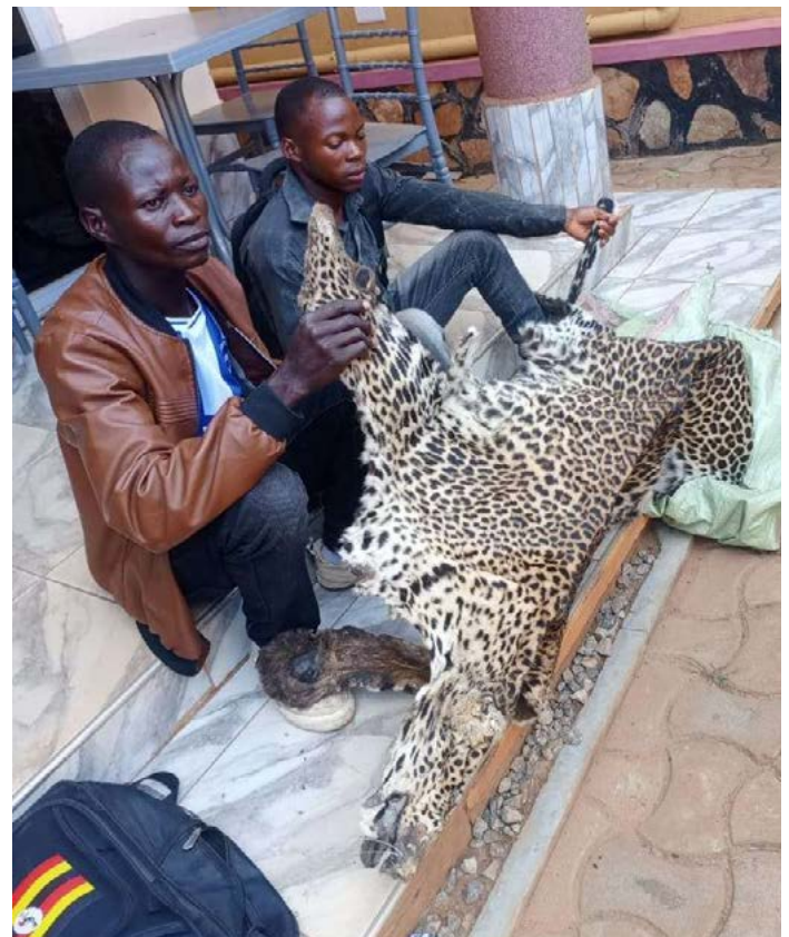
2 traffickers arrested in Uganda with a fresh large leopard skin

An ivory trafficker arrested with 2 elephant tusks in Lome, Togo. He is a part of a trafficking ring stretching to Burkina Faso and Ghana. The trafficker is a dangerous figure within the trafficking ring. He is implicated in multiple illicit activities, including ivory trafficking, and is linked to a well known group of highly dangerous traffickers operating in the far North. The ring frequently smuggles ivory across the northern border between Togo and Burkina Faso. The trafficker transported the elephant tusks on the back of his motorcycle, carefully concealed in a grains bag.