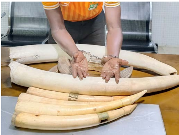
An ivory trafficker arrested with 6 elephant tusks and 2 hippo teeth in Côte d'Ivoire.

4 traffickers were arrested in Guinea with thousands of seahorses weighing 41 kg, along with 26 kg of shark and ray fins, in a crackdown on a criminal network stretching over 5 countries. This criminal network has been trafficking seahorses for the past four decades evolving into a vast cross-border network stretching across West Africa, including Liberia, Sierra Leone, Guinea-Bissau, Gambia, and Senegal. They were trading with Chinese nationals who according to the traffickers, export the seahorses through organized channels of corruption and bribery, allowing massive quantities of protected marine species to leave the region illegally each year.