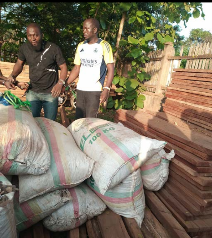
3 major traffickers arrested in Cameroon with 710 kg of pangolin scales