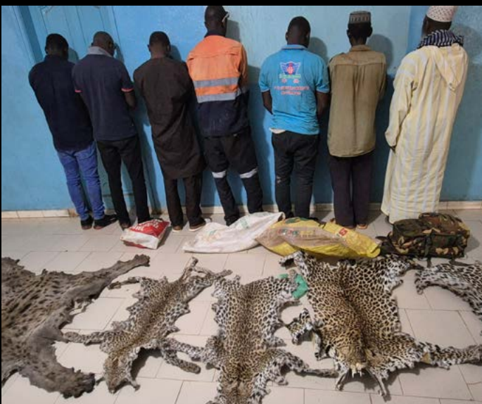
8 traffickers arrested with 4 leopard skins and a hyena skin in 3 back-to-back operations and a major crack down in Senegal.