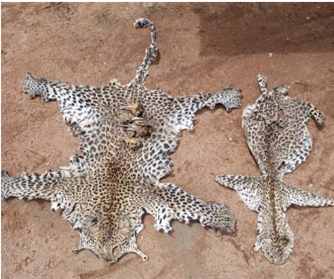
2 traffickers arrested with 2 leopard skins and heads and claws of 4 vultures in Côte d'Ivoire.