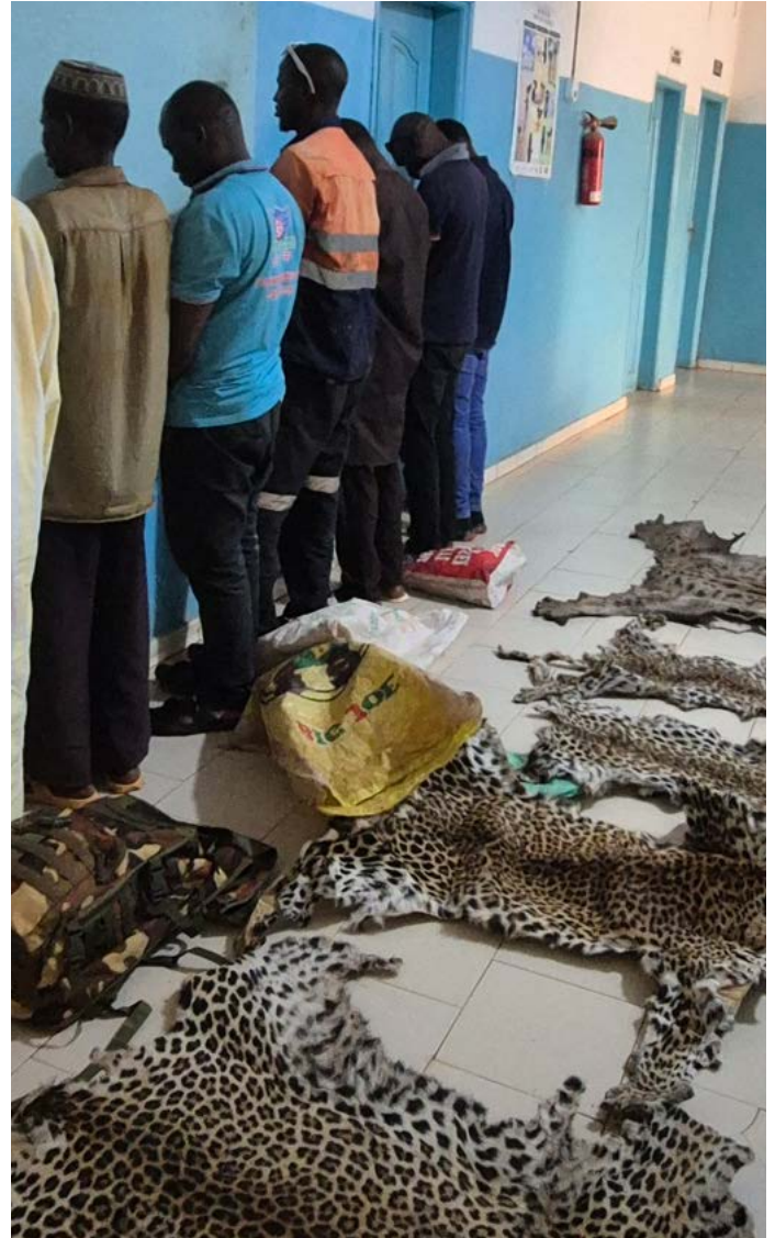
8 traffickers arrested with 4 leopard skins and a hyena skin in 3 back-to-back operations and a major crack down in Senegal

3 ivory traffickers arrested with a large tusk in a crack-down on Ghana-Togo trafficking ring in Togo. The activities of the very cautious and suspicious traffickers were followed for several months before being uncovered. One of them originates from Benin and is a member of a trafficking network that straddles the borders between Togo and Ghana.