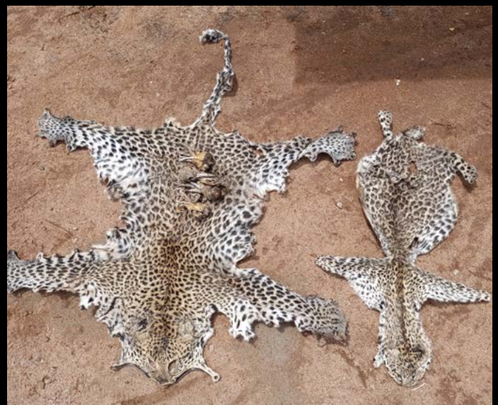
2 traffickers arrested with 2 leopard skins and heads and claws of 4 vultures in Côte d'Ivoire.