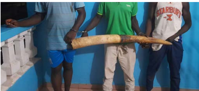
3 ivory traffickers arrested with a large tusk in a crackdown on Ghana-Togo trafficking ring in Togo.