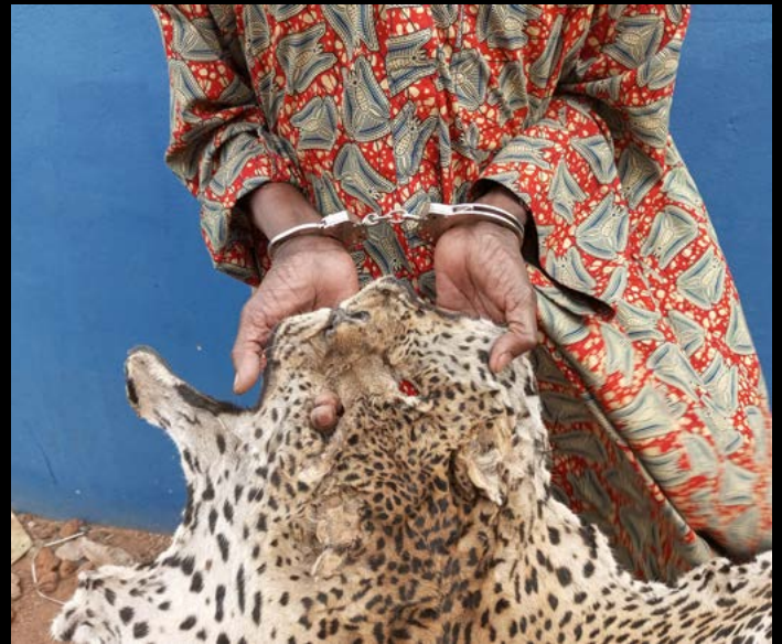
2 traffickers arrested in Côte d'Ivoire with 3 leopard skins