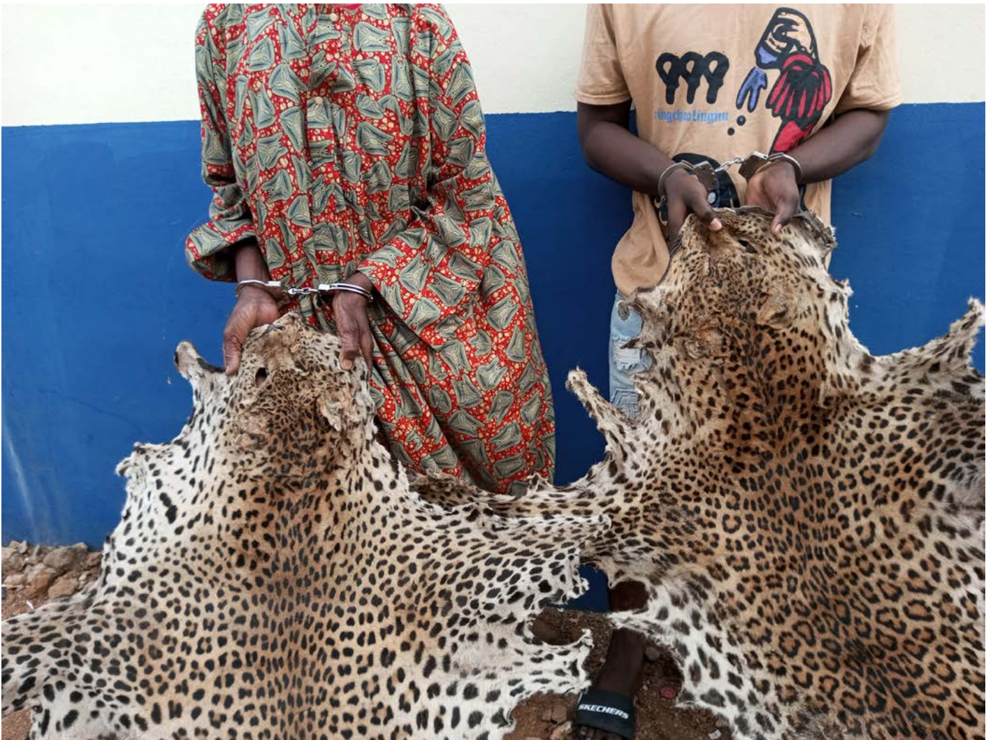
2 traffickers arrested in Côte d'Ivoire with 3 leopard skins

The illegal trade is threatening the survival of the leopard, especially in Central and West Africa where we believe a silent race to extinction is going below conservationists' radar.