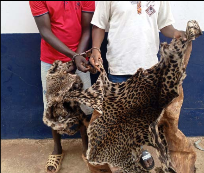
3 traffickers arrested with 2 leopard skins in Congo