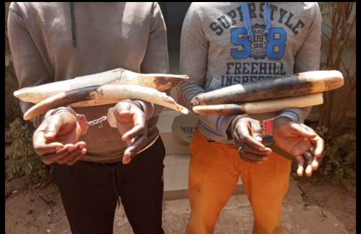
2 traffickers arrested with 4 tusks in the north of Côte d'Ivoire.