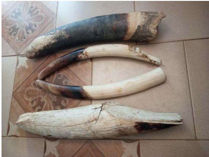
2 traffickers arrested with 4 tusks in the north of Côte d'Ivoire.

An ivory trafficker arrested with 2 tusks in Congo. He was attempting to sell the elephant tusks. He travelled over 300 km with the elephant tusks concealed in a backpack. He used a motorcycle to arrive the place of transaction and was instantly arrested, handcuffed and whisked away.