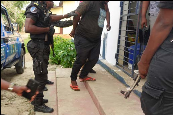
An ivory trafficker arrested with 2 tusks in Congo.