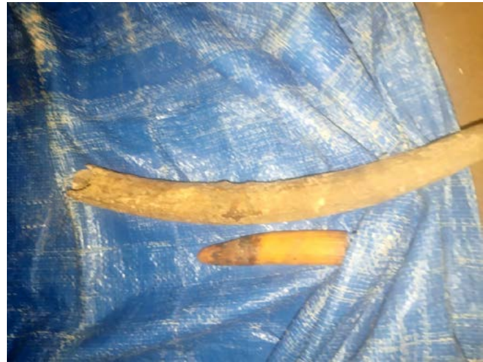
An ivory trafficker arrested with 2 tusks in Congo.

An ivory trafficker arrested with 2 tusks in Congo. He was attempting to sell the elephant tusks. He travelled over 300 km with the elephant tusks concealed in a backpack. He used a motorcycle to arrive the place of transaction and was instantly arrested, handcuffed and whisked away.