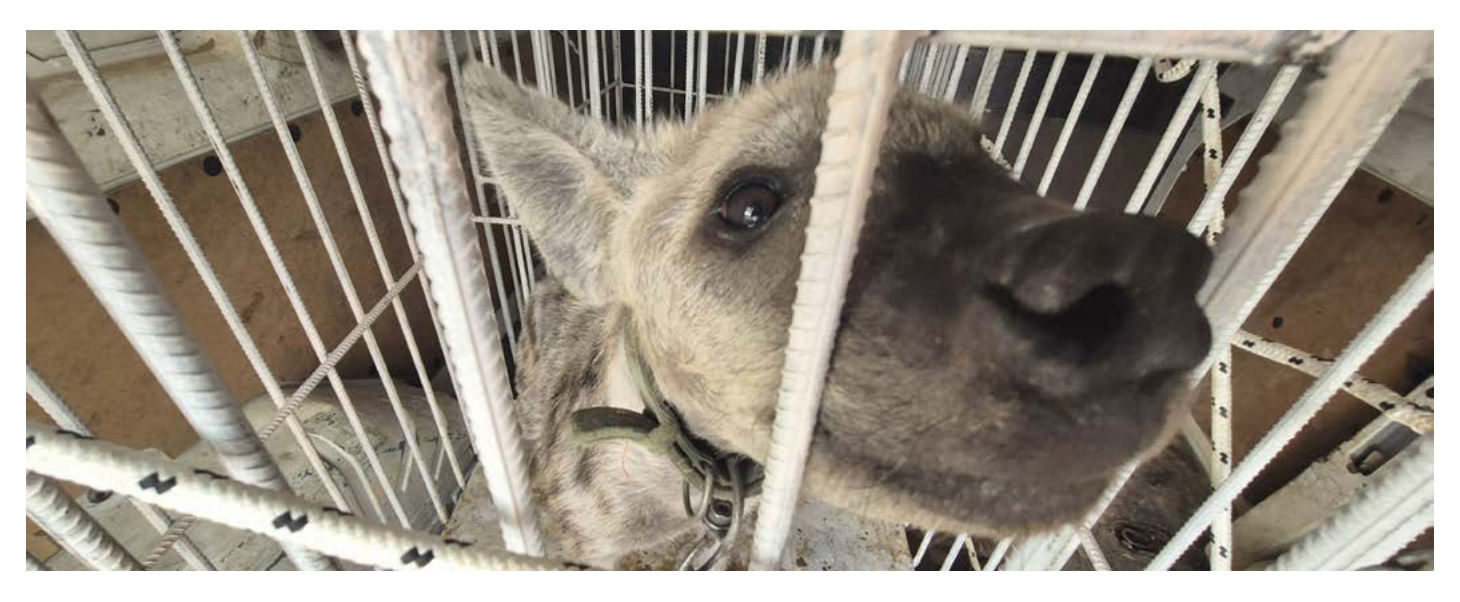
The EAGLE NETWORK – LAGA, PALF, EAGLE Togo, EAGLE Senegal, EAGLE Côte d'Ivoire, EAGLE Uganda, EAGLE Guinea Cameroon, Congo, Togo, Senegal, Côte d'Ivoire, Uganda, Guinea **February 2025 | 5**