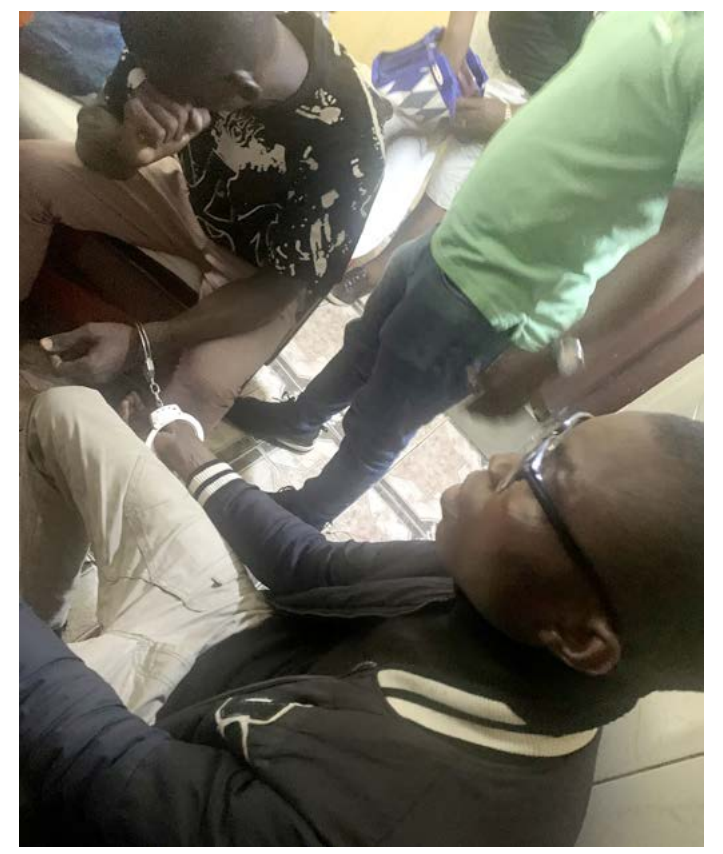
2 ivory traffickers arrested with 2 elephant tusks in Cameroon.