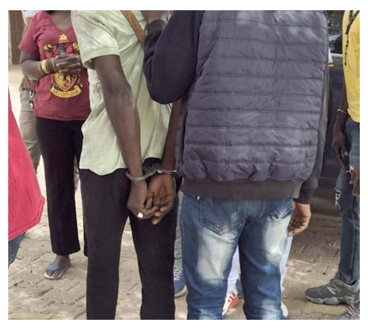
3 live animals' traffickers arrested with 2 young live hyenas in Senegal.

by the illegal trade as mystical animals for black magic. The traffickers travelled 3 hours with the young hyenas and put them in small cages so besides the wounds from the chains they were also wounded at their faces from the bars.