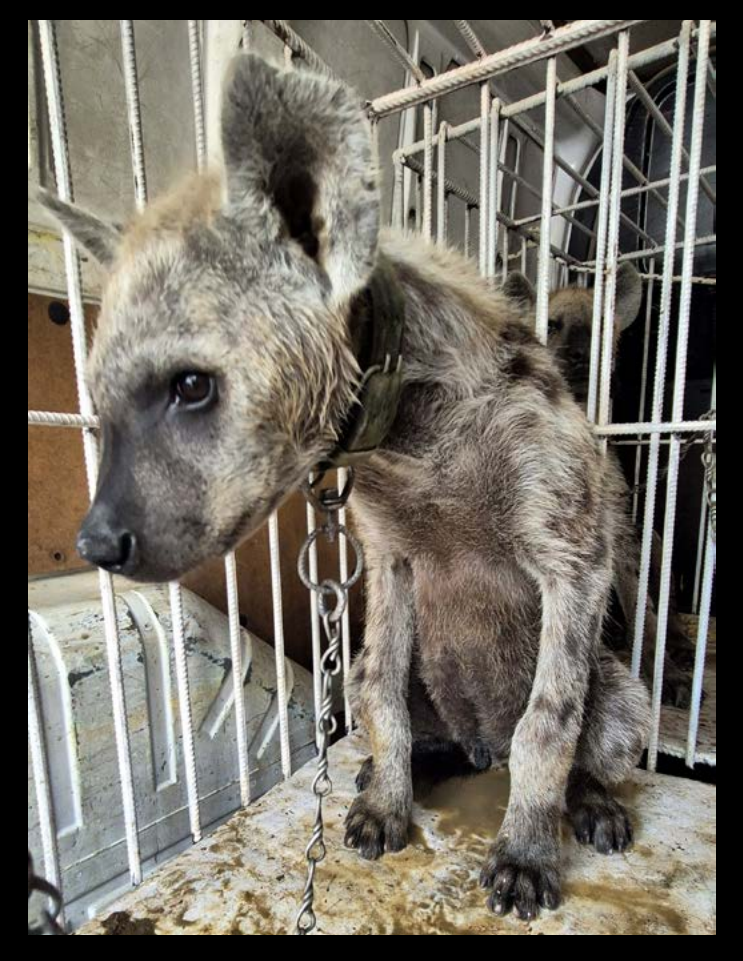
3 live animals' traffickers arrested with 2 young live hyenas in Senegal.