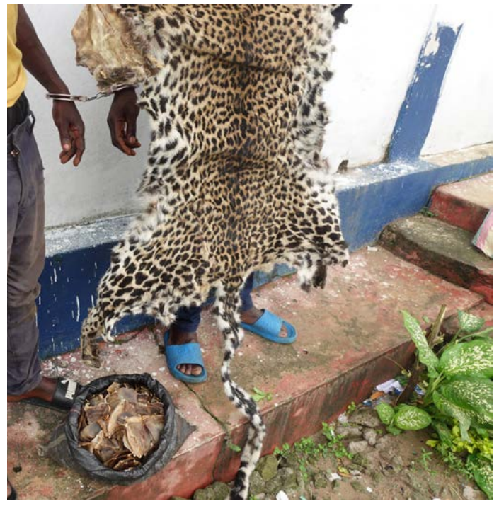
2 traffickers arrested with a leopard skin and scales of giant pangolin in Congo.

2 ivory traffickers arrested with 2 elephant tusks in Cameroon. One of them is a notorious regional trafficker at the center of criminal networks stretching to Chad, Congo and CAR. He is linked to several illicit activities including trafficking in precious stones and cars, in the sub region. He travelled over 500 km from the north of the country to Douala to organize the illegal trade of the tusks.