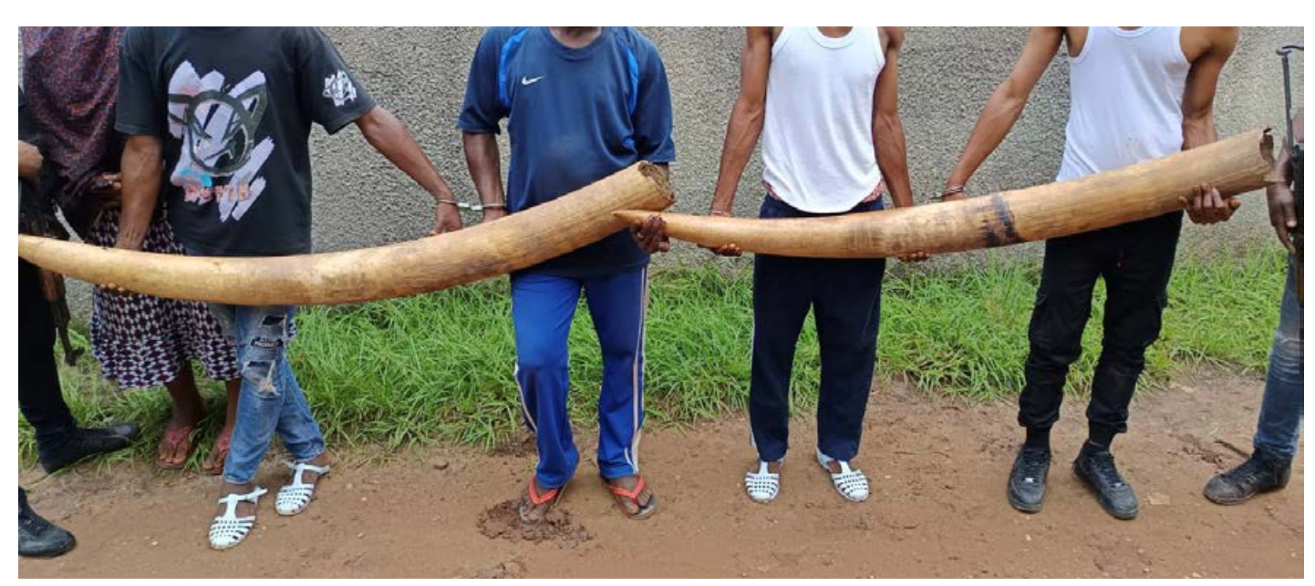
5 ivory traffickers arrested with 2 huge elephant tusks weighing over 60 kg in Côte d'Ivoire.

trafficker is a former rebel in the Congo Democratic Republic and was found in possession of a bag containing elephant feet and hair. He took the arresting team to the spot where the elephant was killed in the forest. The murder charges were dropped while his trial for wildlife crime continues.