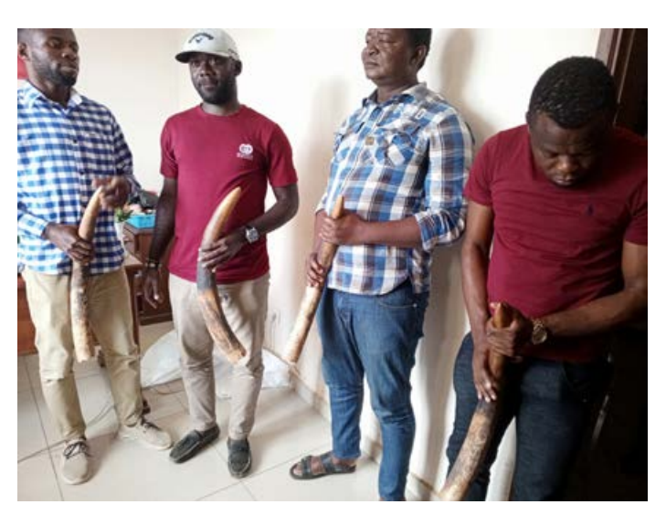
4 traffickers arrested with 4 elephant tusks in Cameroon.

5 ivory traffickers arrested with 2 huge elephant tusks weighing over 60 kg in Côte d'Ivoire. The traffickers were extremely careful pulling many tricks to avoid getting caught till their eventual arrest. Two of the traffickers attempted to escape but were quickly apprehended. The tusks were probably from of a forest elephant from Tai National Park. The elephant tusks were dug out from a field where the traffickers had hidden them.