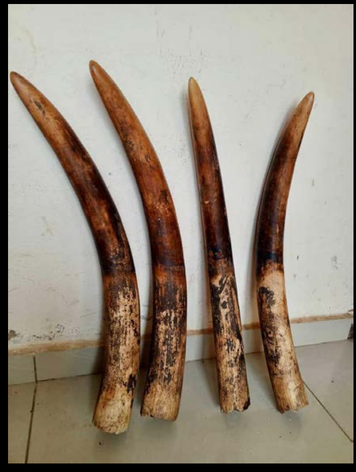
4 traffickers arrested with 4 elephant tusks in Cameroon.