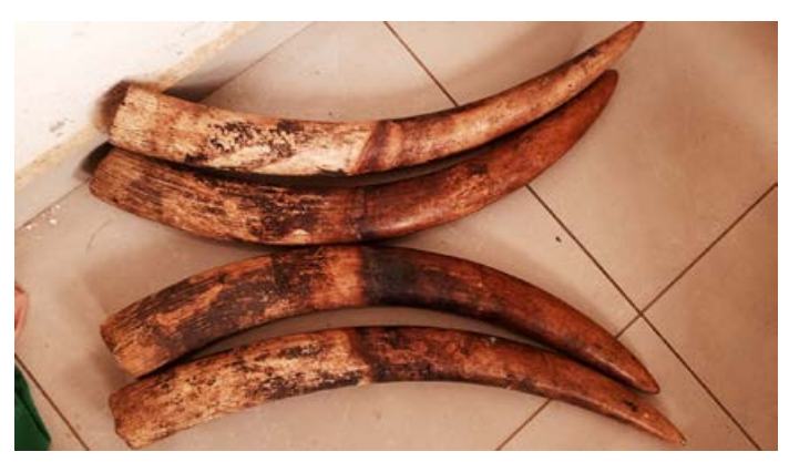
4 traffickers arrested with 4 elephant tusks in Cameroon.

PALF initiated the legal procedure for a trafficker arrested on murder charges with elephant parts. The