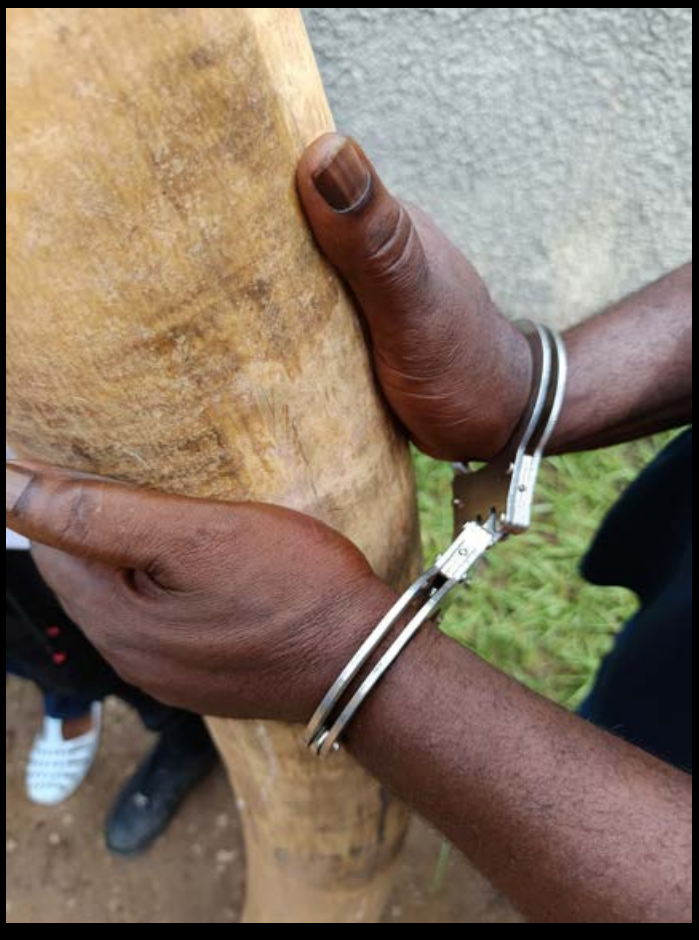
5 ivory traffickers arrested with 2 huge elephant tusks weighing over 60 kg in Côte d'Ivoire.