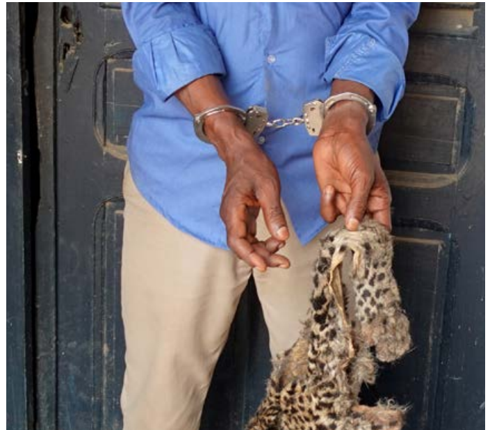
A trafficker arrested with a leopard skin in Congo.