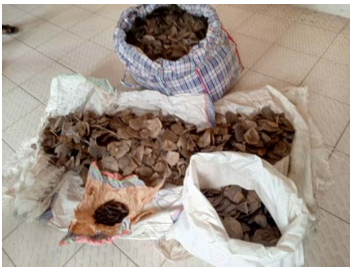
2 traffickers arrested with 81 kg scales of giant pangolins in Congo.

2 traffickers arrested with 81 kg scales of endangered giant pangolins and 24 nails in the north of Congo. One is a priest while the other is a worker contracted by city council to lay fiber optic cables around villages - both used their positions to trade