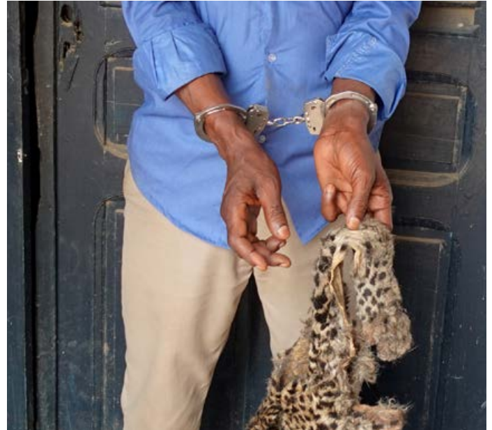
A trafficker arrested with a leopard skin in Congo.

A trafficker arrested with a leopard skin in Congo. The logging company worker travelled a long distance from the north end of the country. On arrival at his destination he boarded a motorcycle with the