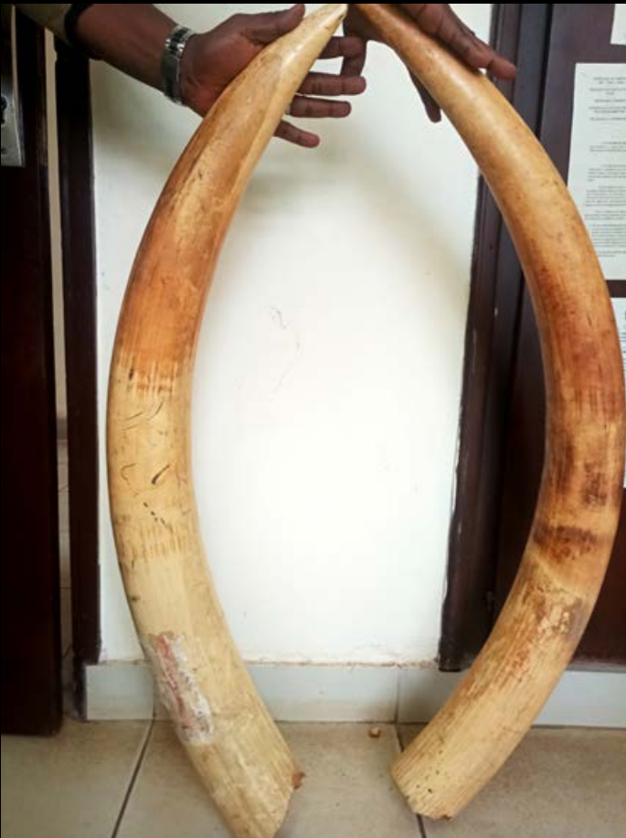
3 traffickers arrested with 2 elephant tusks in Cameroon.