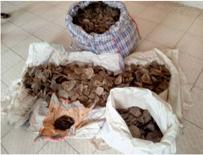
2 traffickers arrested with 81 kg scales of giant pangolins in Congo.

hid the scales in a car tyre to evade control by wildlife officials while moving the scales around. They ran a network of several smaller traffickers.