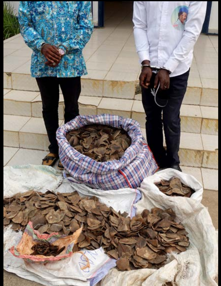
2 traffickers arrested with 81 kg scales of giant pangolins in Congo.