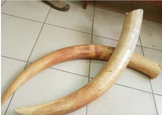
3 traffickers arrested with 2 elephant tusks in Cameroon.

3 traffickers arrested with 2 elephant tusks in Cameroon. A retired Colonel of the Ministry in charge of Wildlife that has also been in charge of several National Parks was among them. The Colonel that abused his position has been charged and forwarded to court with the others. The traffickers concealed the elephant tusks in the boot of a car. They refused to open the boot in an attempt to foil the arrest operation.