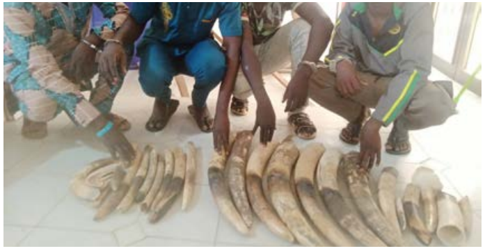
4 traffickers arrested with 11 tusks, 8 ivory pieces and 7 hippo teeth