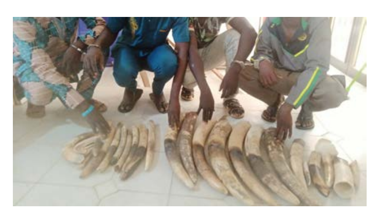
4 traffickers arrested with 11 tusks, 8 ivory pieces and 7 hippo teeth in a crackdown on a cross-border trafficking ring in Togo.

A trafficker from Burkina Faso arrested with two elephant tusks in Lomé, Togo. He is a government official, trafficking ivory cross-border in collaboration with his boss. The trafficker is involved in counterfeit money criminality. The ivory tusks were well-pack-