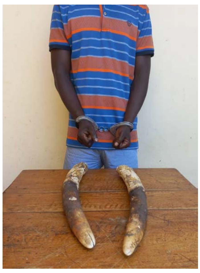
A trafficker from Burkina Faso arrested with two elephant tusks in Lomé, Togo.

A significant notorious ivory trafficker arrested in Cameroon. Using corruption he negotiated his release from police custody in Nigeria. He was arrested by Nigeria customs in February at a border town with a handgun and 200 kg of ivory tusks he trafficked from Cameroon. He was also under investigations for his connection to the seizure of 131 kg of ivory in August last year and the arrest of 9 traffickers in Gabon.