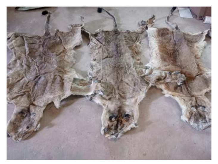
A trafficker arrested with 3 lion skins in Uganda.

A trafficker arrested with 3 lion skins in Uganda. She seems to specialize in lion parts trafficking. One of the skins was very fresh. This is a mere snapshot of an ongoing regular lion skins trafficking of this ring. Lion numbers in Uganda are plummeting, estimated to have only 200-300 remain in the whole country