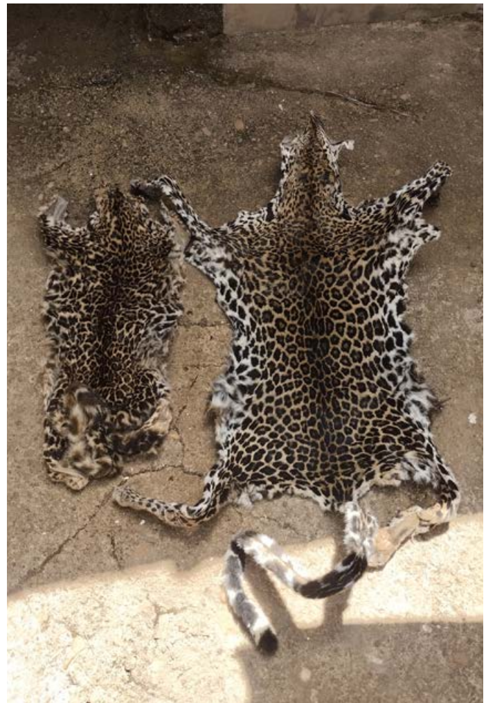
A trafficker arrested with 2 leopard skins, probably a mother and a cub, in Côte d'Ivoire.