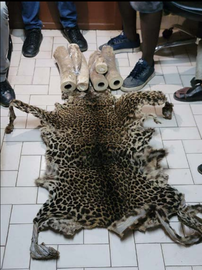
3 traffickers arrested with 6 pieces of elephant tusks and a leopard skin in Gabon.