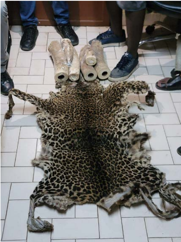
3 traffickers arrested with 6 pieces of elephant tusks and a leopard skin in Gabon.

A trafficker arrested with 2 leopard skins, probably a mother and a cub, in Côte d'Ivoire. The trafficker stored the skins in the house of a traditional chief in an attempt to get impunity. The trafficker worked with several poachers who supplied him with rare animal products. They drove to the place of transaction with the skins concealed inside the car.