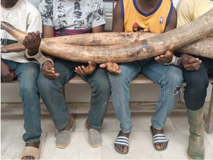
4 traffickers, including a veteran soldier, arrested with 2 elephant tusks weighing 42 kg in Côte d'Ivoire

4 traffickers, including a veteran soldier, arrested with 2 elephant tusks weighing 42 kg in Côte d'Ivoire. They used a motorcycle to transport the elephant tusks that were stored in a nearby village. The traffickers were intending to use the profit from the deal