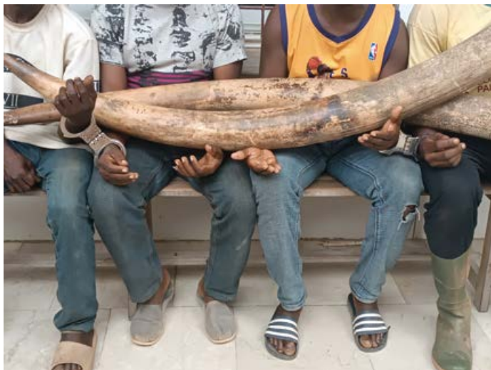
4 traffickers, including a veteran soldier, arrested with 2 elephant tusks weighing 42 kg in Côte d'Ivoire