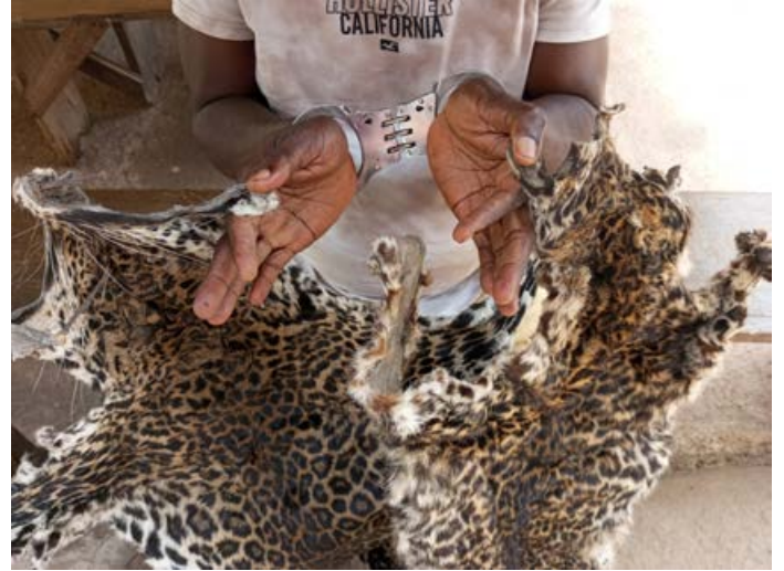
A trafficker arrested with 2 leopard skins, probably a mother and a cub, in Côte d'Ivoire.

to generate the killing of elephants in the Tai National Park. The operation took place close to the Park which is the biggest contiguous rainforest of West Africa. From several indications, the tusks were from an adult elephant slaughtered in the park that has an estimated population of 300 elephants. Elephants, the country's emblem, are on the brink of extinction in the country: their numbers have halved in thirty years.