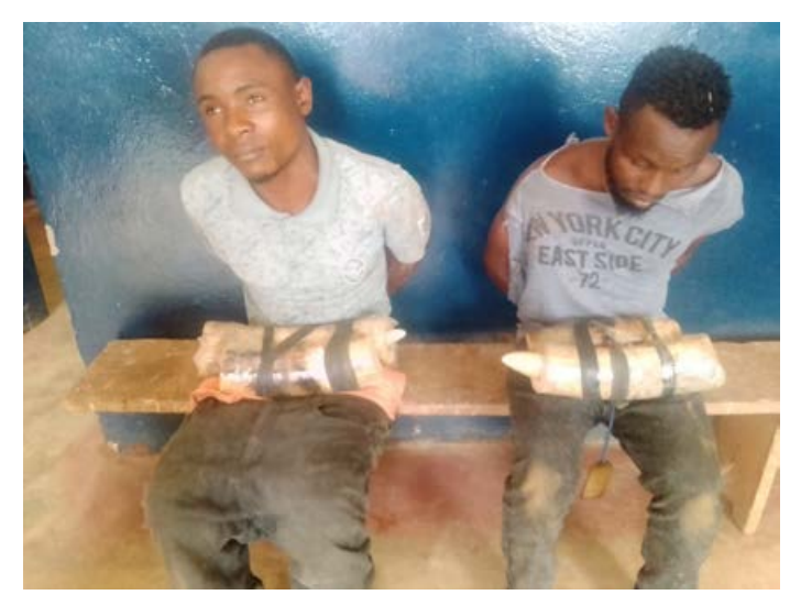
2 traffickers arrested with 6 pieces of ivory in Congo.

A major trafficker arrested in Senegal with 2 elephant tusks and 80 carved ivory items in a crackdown on a transnational trafficking ring. The seizure includes also 18 leopard teeth and many wild animal skins.