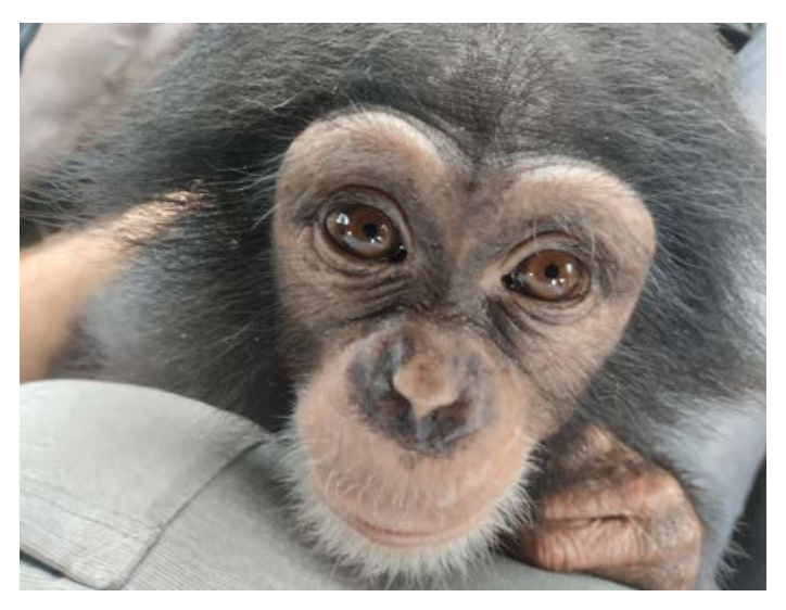
2 ape traffickers arrested and a baby chimp rescued in Côte d'Ivoire

2 ape traffickers arrested and a baby chimp rescued in Côte d'Ivoire in a crackdown on a transnational criminal network. This criminal network has been trafficking apes from Liberia, Ivory Coast and Guinea to China and to countries of the Arab Gulf. It applies similar modus operandi to previously dismantled networks in Guinea. Apes are smuggled under the cover of a legal business of live animals and connections with some of the biggest ape traffickers known in Africa are being investigated.