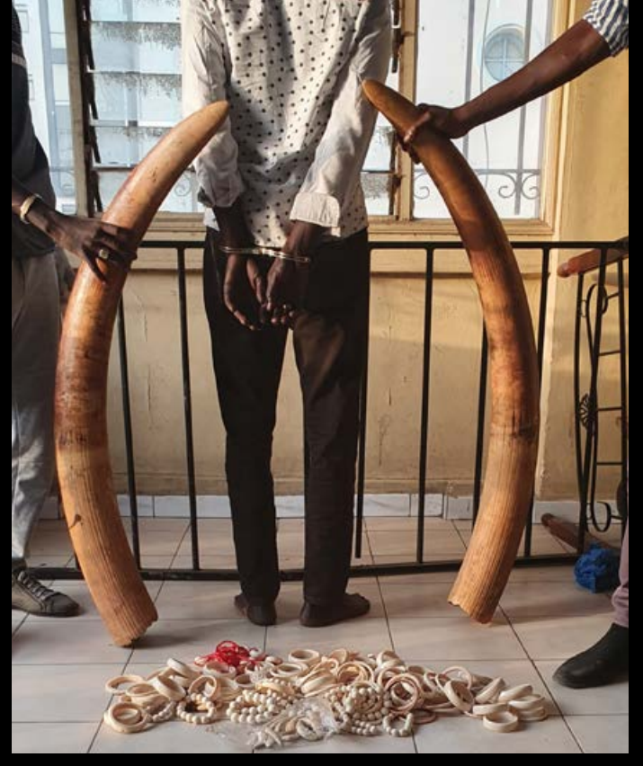
A major trafficker arrested in Senegal with 2 elephant tusks and 80 carved ivory items