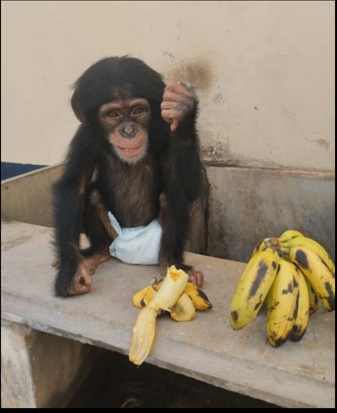
2 ape traffickers arrested and a baby chimp rescued in Côte d'Ivoire