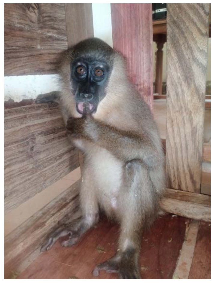
A primate trafficker arrested and a drill rescued in Cameroon.

A primate trafficker arrested and a drill rescued in Cameroon. The very young drill, an endangered primate, stressed and agitated, was tied with a rope in the waist. The trafficker, who works for a city council, transported the cage with the drill on his bike.