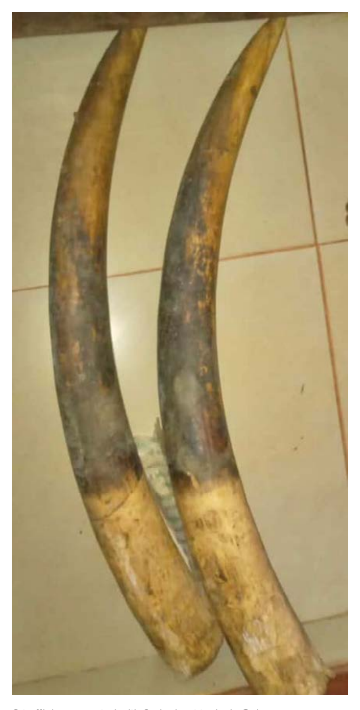
3 traffickers arrested with 2 elephant tusks in Gabon.

2 traffickers arrested with a leopard skin in Congo. They arrived the scene of transaction on a motorcycle with one of them firmly grasping a backpack containing a jute bag. On arrival, he removed the jute bag that concealed the leopard skin. He was arrested. He denounced another trafficker at the police station who was later apprehended.