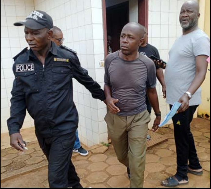
3 traffickers arrested with 91 kg of pangolin scales in back-to-back arrests in Cameroon.