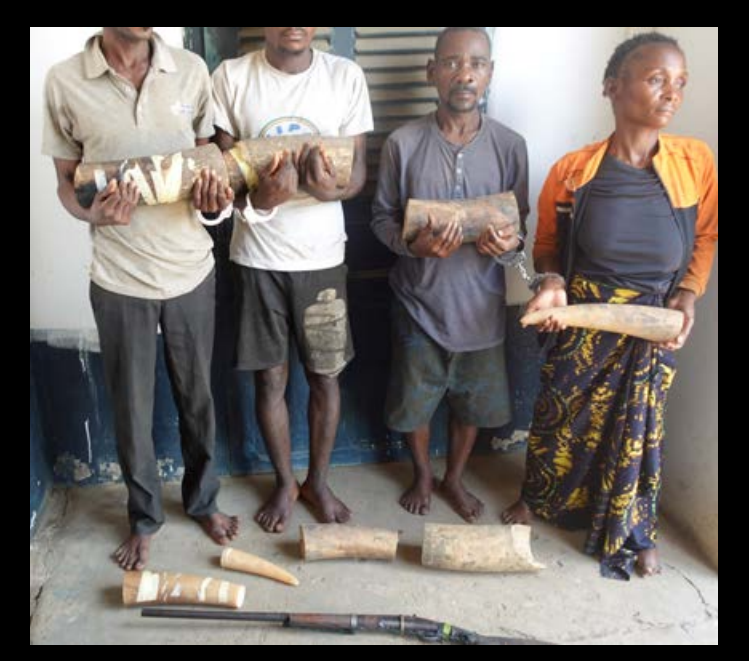
4 traffickers arrested with an elephant tusk and 5 ivory pieces all weighing over 27 kg in Congo.