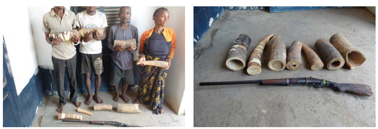
4 traffickers arrested with an elephant tusk and 5 ivory pieces all weighing over 27 kg.