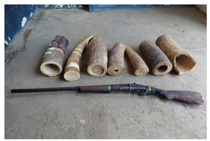
4 traffickers arrested with an elephant tusk and 5 ivory pieces all weighing over 27 kg in Congo.

2 traffickers, including a military Marines officer, arrested with a leopard skin in Congo. He transported the leopard skin in his car to Pointe Noire where he attempted to sell the contraband. After failing to conclude a deal, he contacted another trafficker, and both were arrested during attempts to sell the skin. The warrant officer resisted arrest and it took several minutes for the gendarmes to subdue the violent trafficker.