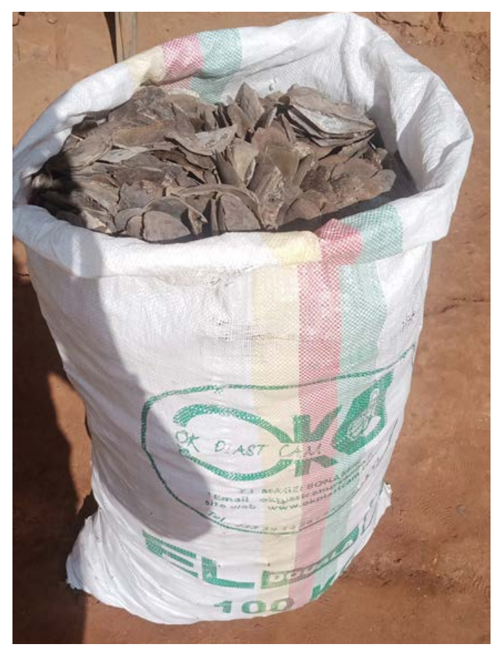
3 traffickers arrested with 91 kg of pangolin scales in back-to-back arrests in Cameroon.

3 traffickers arrested with 91 kg of pangolin scales in back-to-back arrests in Cameroon. 2 traffickers were arrested as they attempted to sell a bag of pangolin scales. A third trafficker was arrested immediately after he arrived in the town where the arrest took place. He transported the pangolin scales on a motorbike from a nearby locality. They are well connected, at a significantly high level, to trafficking of pangolin