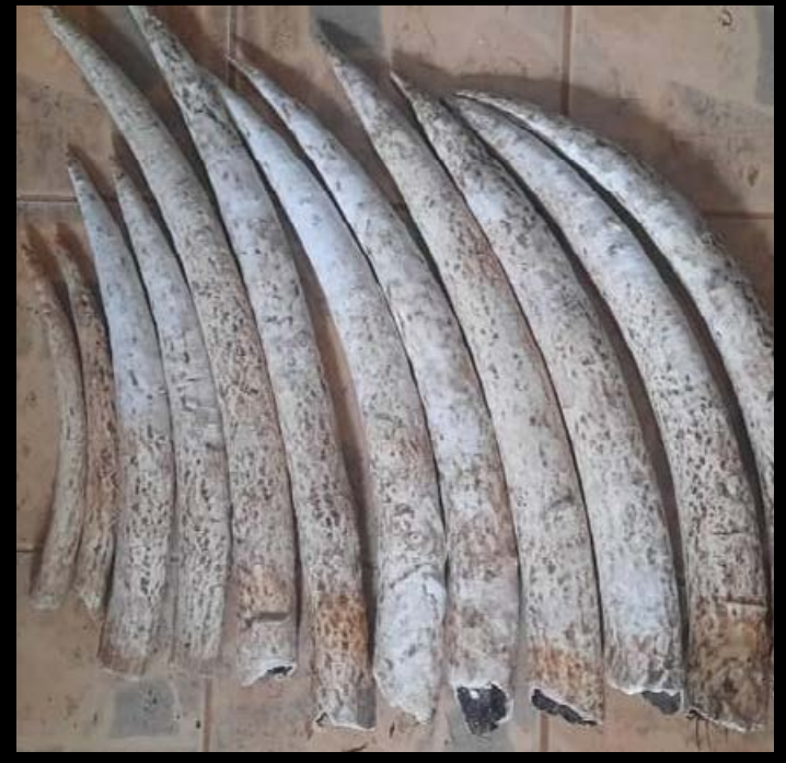
3 traffickers, including a Burkinabe national, arrested with 12 elephant tusks in Gabon.