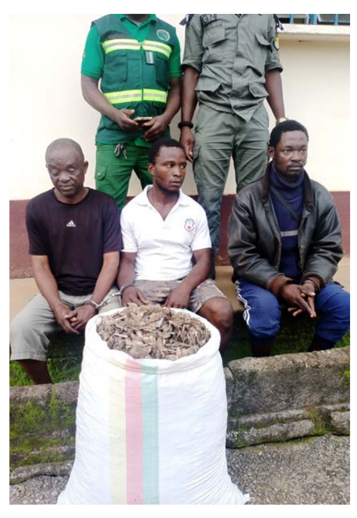
3 traffickers arrested with 78 kg of pangolin scales in Cameroon.

5 traffickers arrested with 53 kg of pangolin scales and a hippo tooth in Congo. They were arrested in a complex operation that took much patience and initiatives by the arresting team. Some of the scales are of the rarer giant pangolin. The criminals were also caught trafficking two minerals - red cinnabar (mercury sulphide) and white cinnabar (mercury sulphate), the second being extremely lucrative for trafficking and toxic even for mere inhaling.