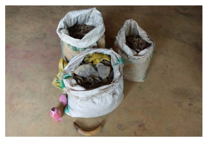
5 traffickers arrested with 53 kg of pangolin scales and a hippo tooth in Congo.

3 traffickers arrested with 78 kg of pangolin scales in Cameroon. They were cautious, tried a number of tricks and came around without the pangolin scales to the place of transaction. They were very knowledgeable in the illegal business and did everything they could to avoid arrest.