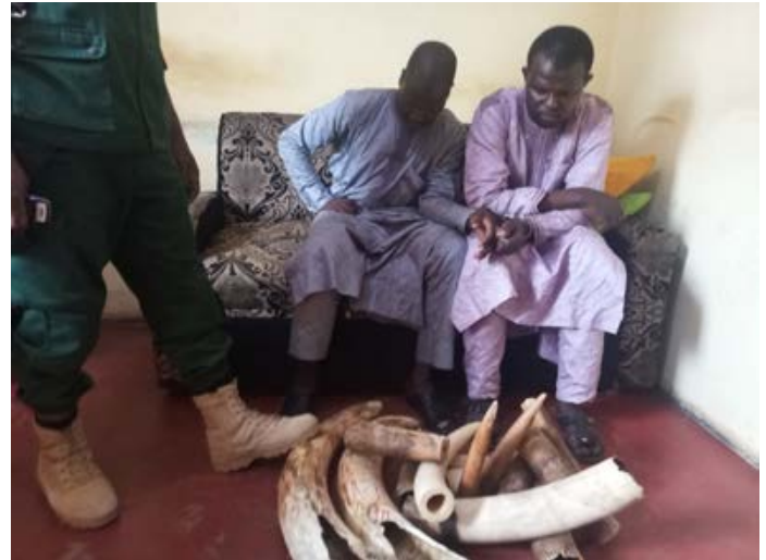
2 traffickers arrested with 10 elephant tusks weighing 56 kg.