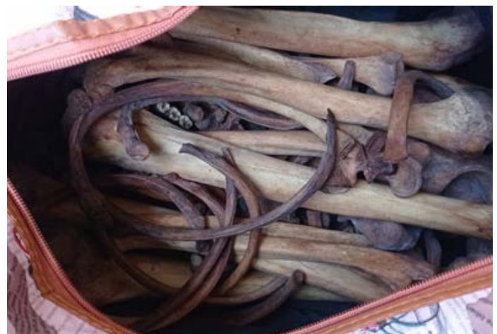
4 traffickers arrested with 2 human skeletons

■ 4 traffickers arrested with 2 human skeletons. They transported the skeletons concealed inside a big plastic bag the south west of the country to Douala where they lodged in a luxury hotel. Later, they moved to another hotel to sell the skeletons