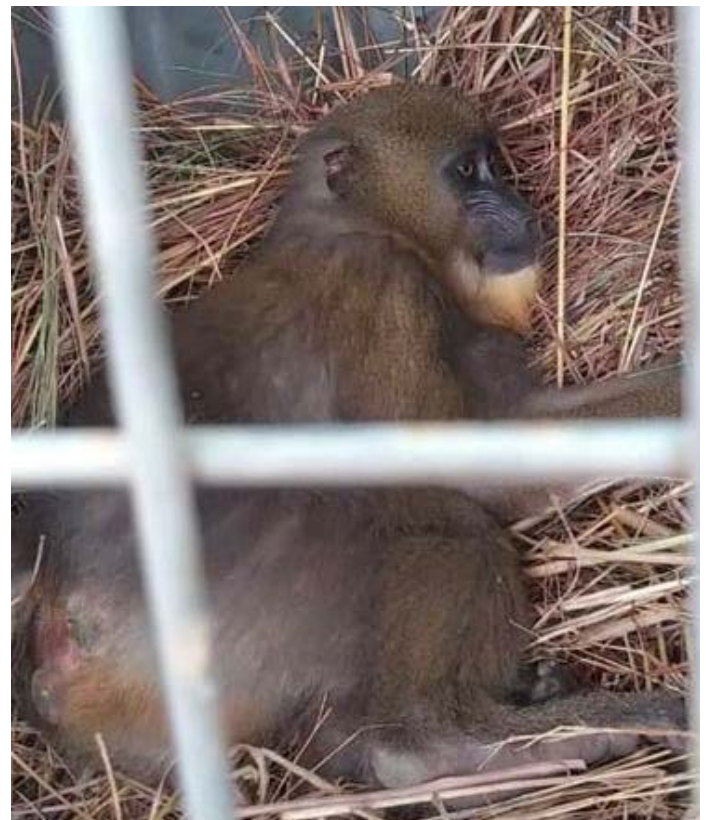
A fugitive mandrill trafficker arrested.