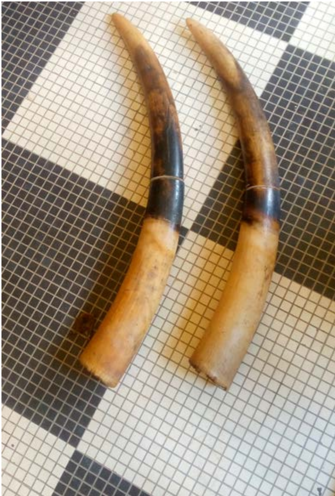
3 traffickers, including a logging company worker, arrested in Gabon with 2 tusks.

back-to-back operations in two different towns. One of the traffickers, who operates under the guise of an entrepreneur, was arrested as he attempted to sell the elephant tusks that were cut into 8 pieces. He is the middleman of the group. He travelled over 100 km with the tusks concealed inside a black knapsack. After his arrest, investigations continued and two others were arrested in