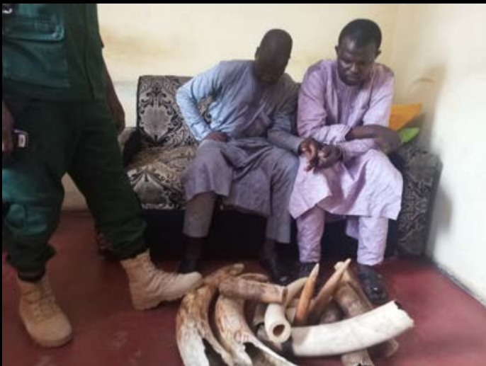
3 traffickers arrested in Cameroon with almost 100 kg of ivory