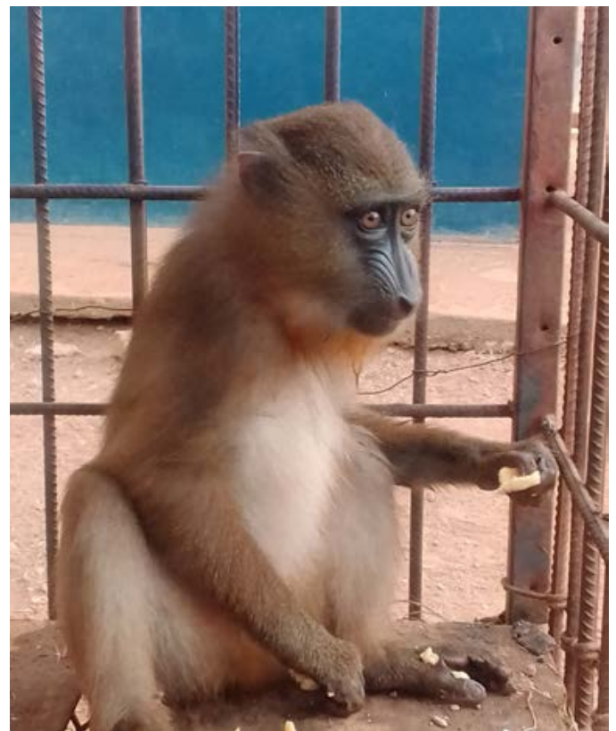
A trafficker arrested and a mandrill rescued in Congo.

A fugitive mandrill trafficker arrested in Congo. He had been on the run since June when a mandrill was seized from his property.