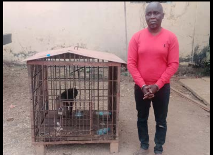
A trafficker arrested and a mandrill rescued in Congo.