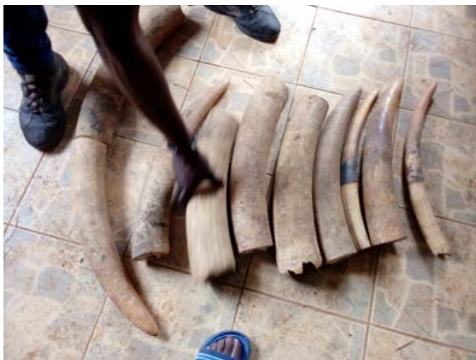
3 traffickers arrested in Gabon with 6 elephant tusks weighing 24 kg.

4 traffickers arrested in Cameroon with 2 human skeletons. Their arrest is a result of an investigation into the illegal online trade in pangolin scales and leopard skins to India. LAGA and the entire EAGLE Network, as activists, do our best to fight injustice. Human sacrifice and the illegal trade in human bones for black magic and rituals is one of such horrible crimes.