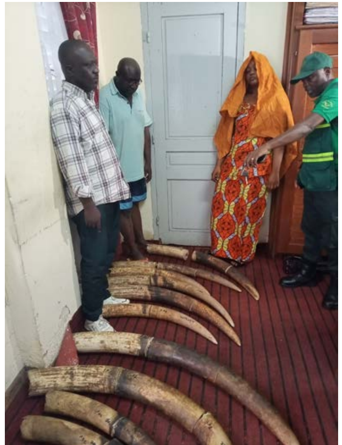
3 traffickers arrested with almost 100 kg of ivory in a crackdown on a Nigerian ivory gang.