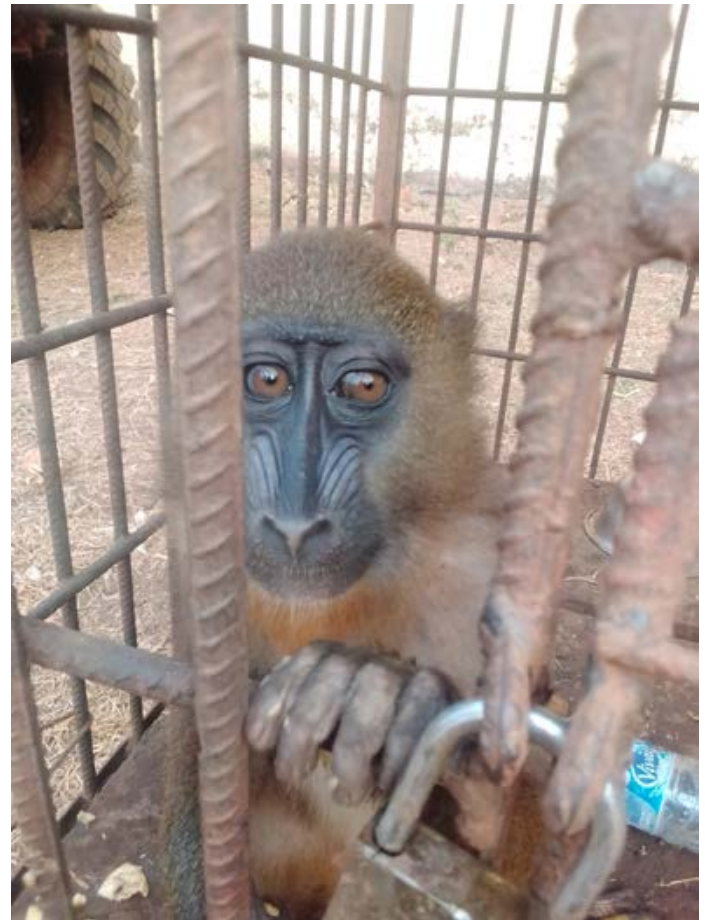
A trafficker arrested and a mandrill rescued.