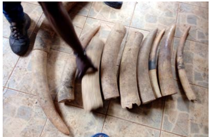
3 traffickers arrested with 6 elephant tusks weighing 24 kg.