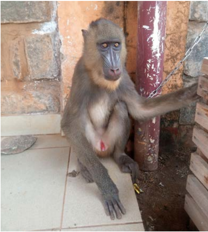
2 traffickers arrested and a mandrill rescued.