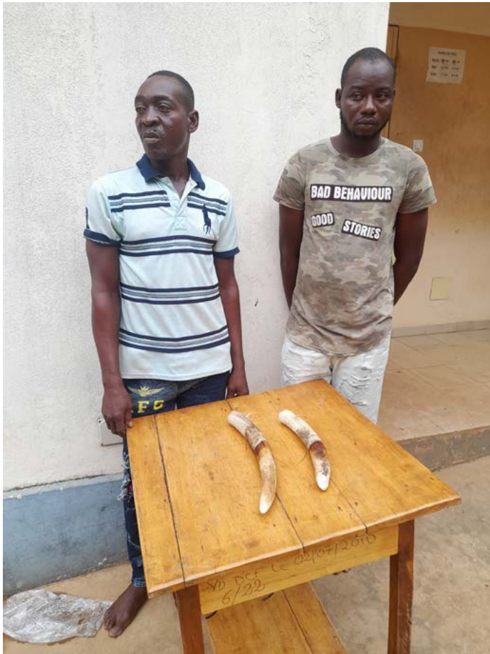
2 traffickers arrested with 2 tusks of a very young elephant in Togo.

■ 2 traffickers arrested with 2 tusks of a very young elephant in Togo. They were arrested during their attempt to sell the tusks. They arrived at the scene