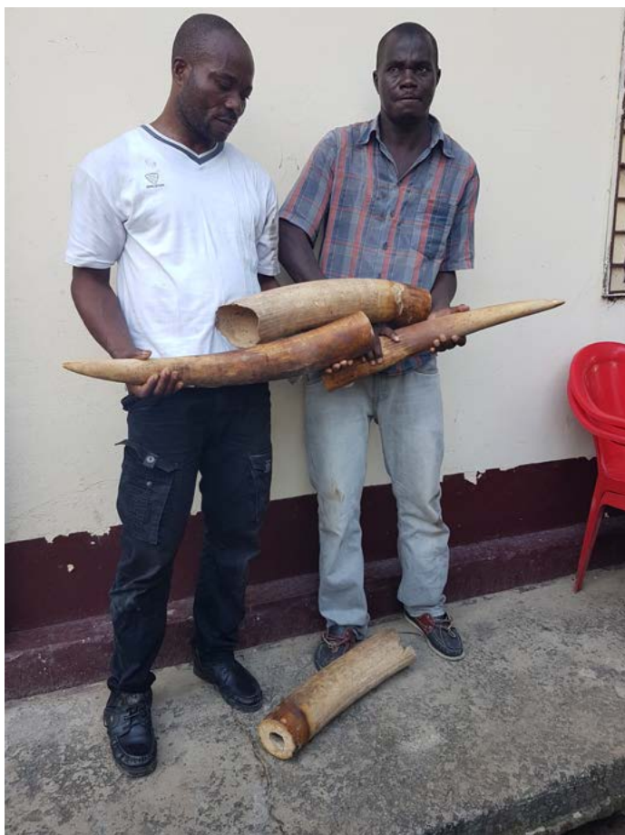
2 traffickers arrested with 2 elephant tusks weighing 20 kg.

■ 2 traffickers arrested with 2 elephant tusks weighing 20 kg. They were arrested during a brief but intense chase. The cautious and smart traffickers attempted to escape on a motorcycle at the moment of their arrest. The arresting team that was on the alert, quickly responded to the fleeing traffickers, immobilized and handcuffed them. One of the traffickers is a repeat offender who had been convicted several times and the second is a Malian. They were extremely suspicious and tried several clever moves to avoid arrest.