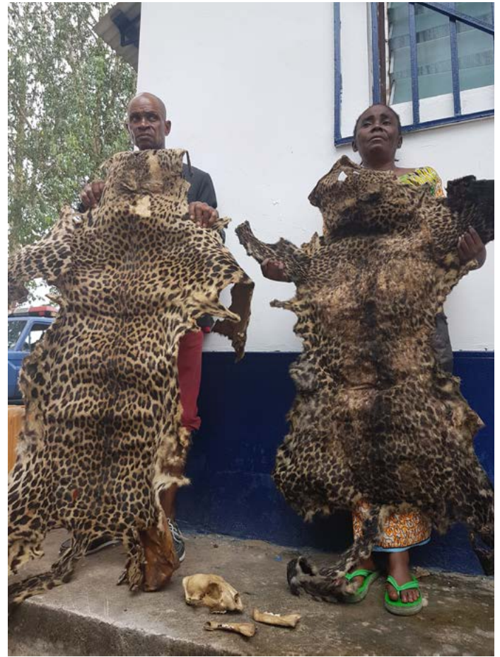
2 traffickers arrested with 2 leopard skins, a skull and a tooth in Congo.

an Union, the United States and Italy. She also met with the General Director of the Ministry of Forest Economy, the General Director of the Congolese Agency for Wildlife and Protected Areas.