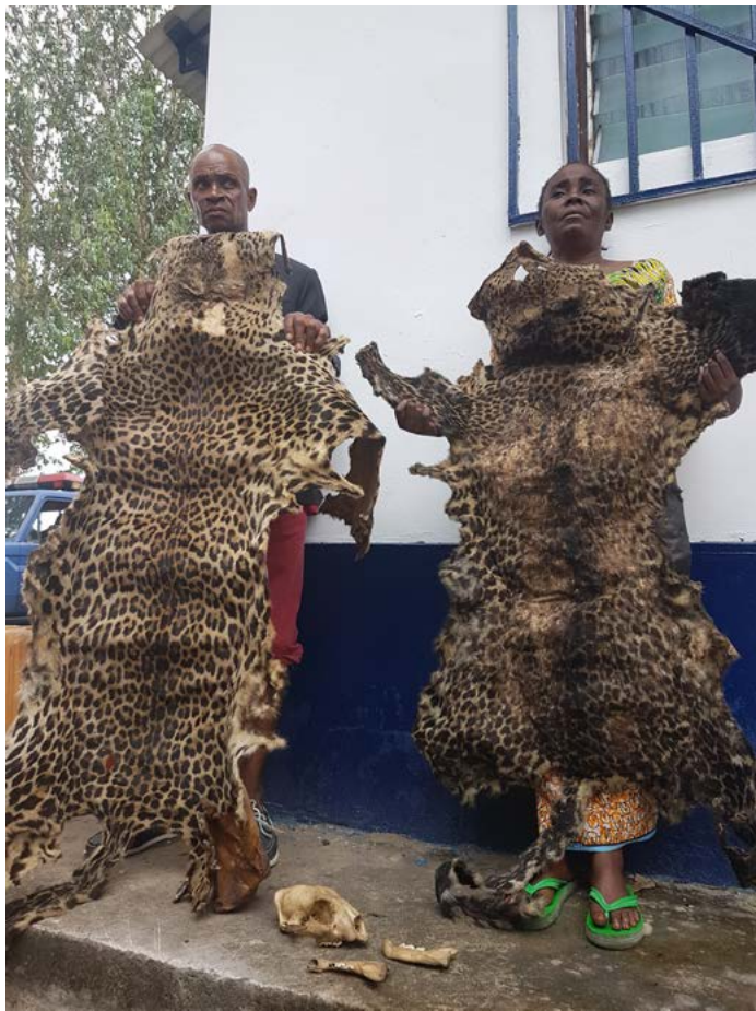
2 traffickers arrested with 2 leopard skins, a skull and a tooth in Congo.

2 traffickers arrested with 2 elephant tusks weighing 20 kg in Congo. They were arrested during a brief but intense chase. The cautious and smart traffickers attempted to escape on a motorcycle at the moment of their arrest. The arresting team that was on the alert, quickly responded to the fleeing traffickers, immobilized and handcuffed them. One of the traffickers is a repeat offender who had been convicted several times and the second is a Malian.