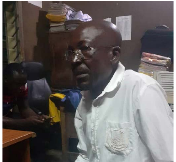
A trafficker arrested in a follow up to a live mandrill rescue and bust in Douala, Cameroon.

A trafficker arrested in a follow up to a live mandrill rescue and bust in Douala, Cameroon. This other member of the ring was exposed during interrogation as the brains and money behind the trafficking, but disappeared and stayed away from his house to avoid arrest.