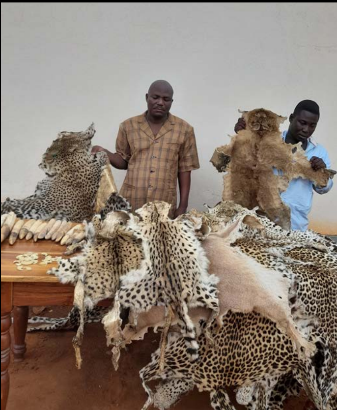
2 traffickers arrested with 2 lion skins, 5 leopard skins and 3 serval skins in a major crackdown on big cat skin trafficking in Togo.