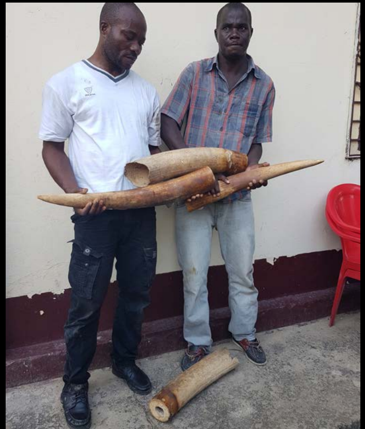
2 traffickers arrested with 2 elephant tusks weighing 20 kg in Congo.