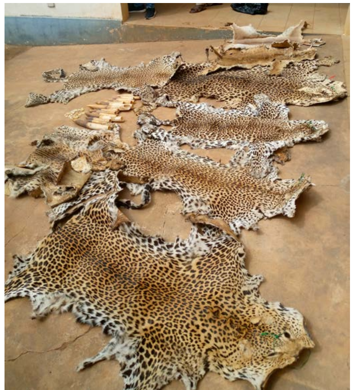
2 traffickers arrested with 2 lion skins, 5 leopard skins and 3 serval skins