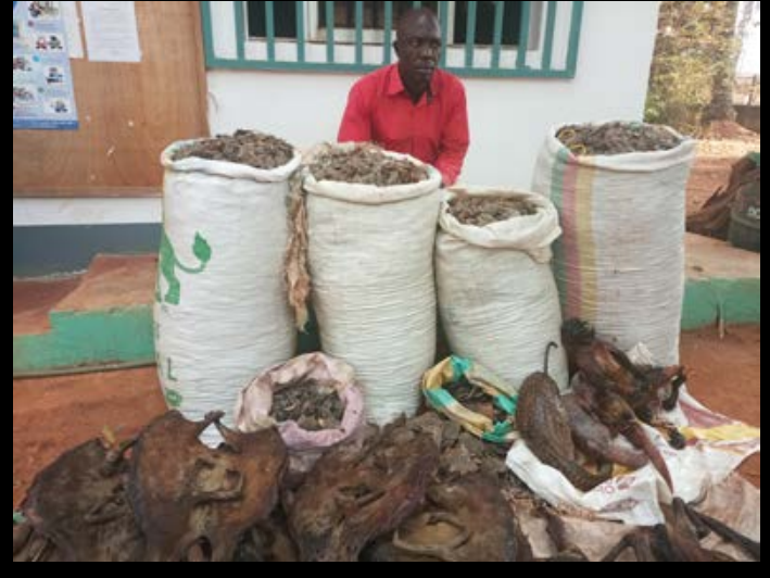
A trafficker arrested in Cameroon with 246 kg of pangolin scales