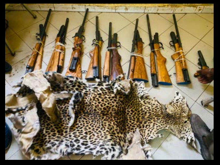
2 traffickers arrested with a leopard skin and nine 12-gauge shotguns in Senegal