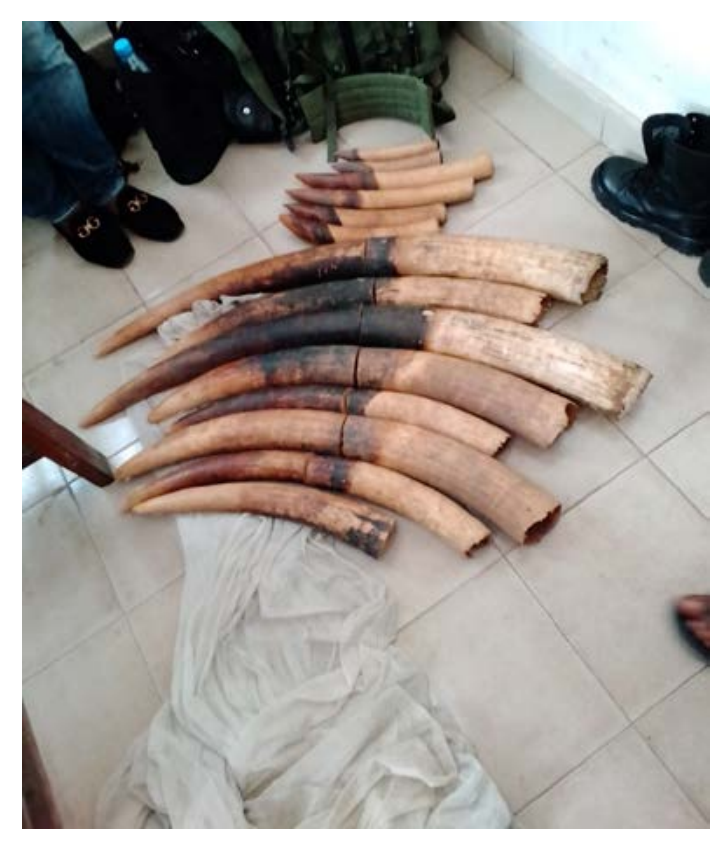
4 traffickers arrested in Congo with 14 elephant tusks.

A trafficker arrested in Cameroon with 246 kg of pangolin scales, and in a refrigerator more pangolins and monkey carcasses found. He activated several traffickers and poachers in the area, who supplied the illegal products. He had the storage facilities for keeping the big quantities of contraband he collected.